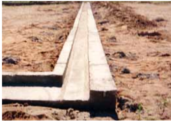
Pour a simple floating foundation