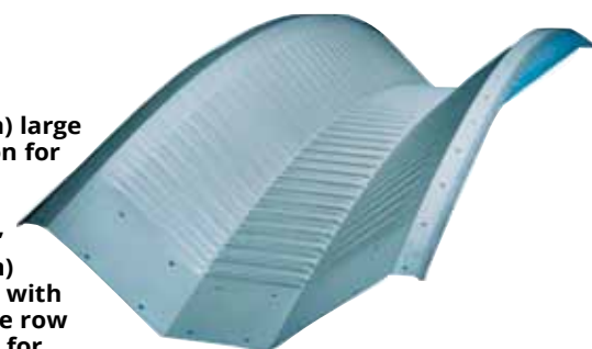
A full 9" (230mm) overlap with a double row of bolts for strength