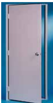
3'x7' (1m x 2.25m) Heavy Duty Commercial Door