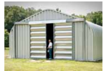
Heavy duty double sliding doors, sealed at top, bottom and sides