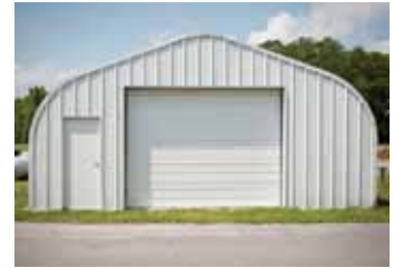
Install doors and endwalls