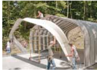
Raise the arches into place