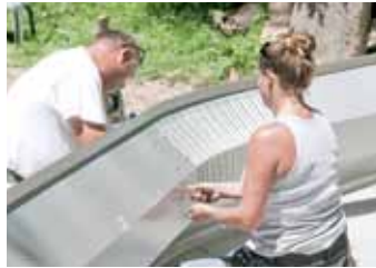
Bolt arches together on the ground