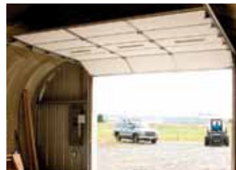
Heavy duty industrial overhead doors