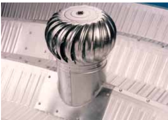
Removes condensation and keeps building dry