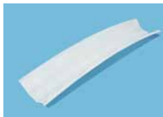
Heavy duty fiberglass offers good lighting